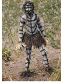
Tchinganji – Gabela