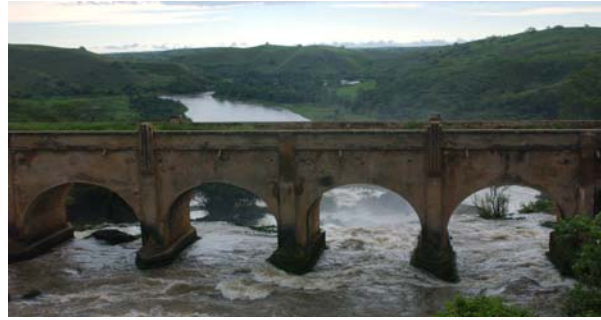
Bridge over River Queve above falls