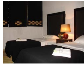
Mangais bedroom Wako Kungo