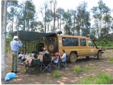
Lunch at Coffee Farm