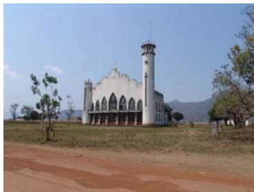
Church at Wako Kungo