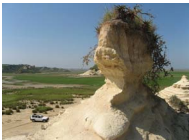
Foz do Queve