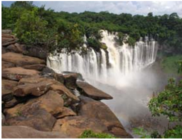
Kalandula Falls (bring swimsuits!)

Accommodation: Hotel Palácio Regina **** Meals included – breakfast, picnic lunch and dinner