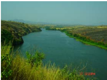
Cambambe Dam reservoir

Accommodation: Hotel Palácio Regina **** Meals included – picnic lunch and dinner.