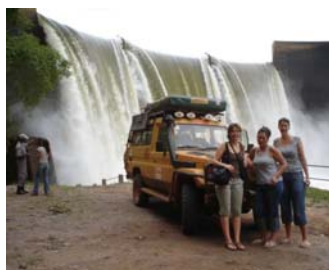
Cambambe Dam wall