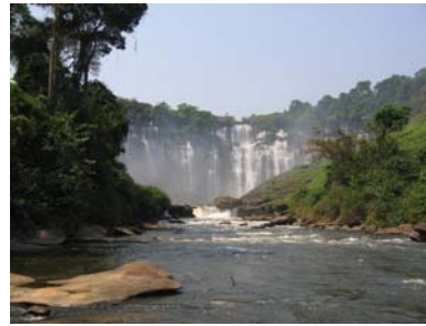
Kalandula Falls view from bottom (bring boots !)