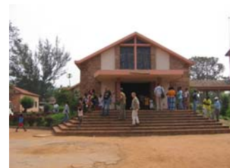
Casa da Gaiato