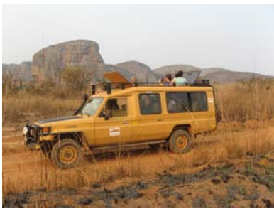
In the cars with the roof open