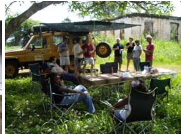
Picnic at Botanical Gardens